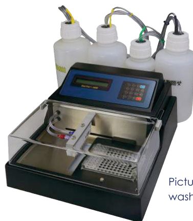
Pictured with optional wash bottle

AWARENESS TECHNOLOGY, INC. www.awaretech.com